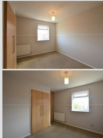
Spacious built in wardrobes/cupboards, neutral carpets