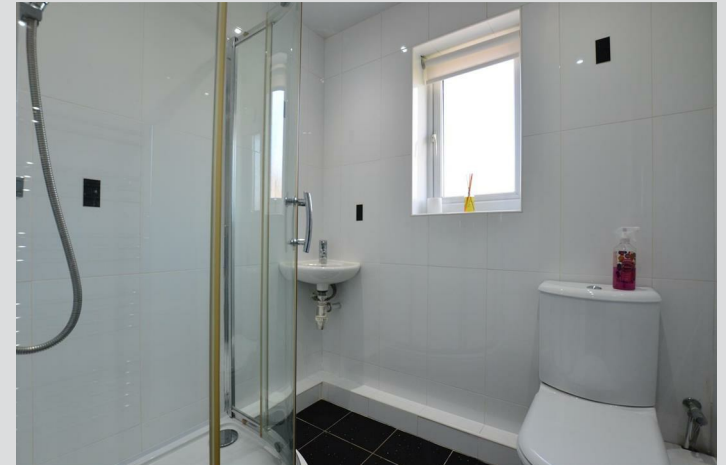
Modern white shower suite

Visit www.peterheron.co.uk or call 0191 510 3323