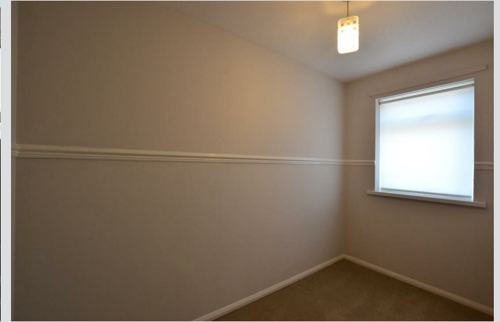
Generous second bedroom with neutral carpets