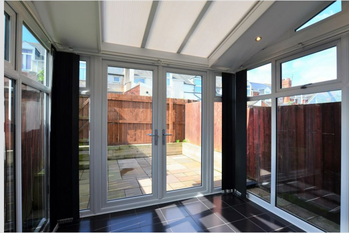
French doors leading to rear garden