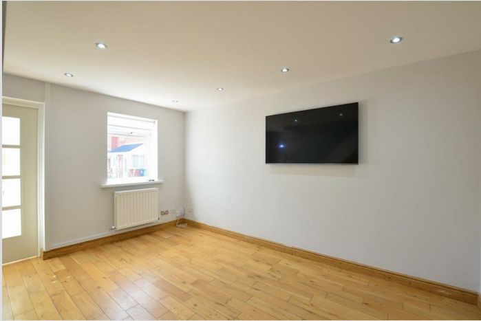
Light beech wood effect flooring, radiator and modern open stairway