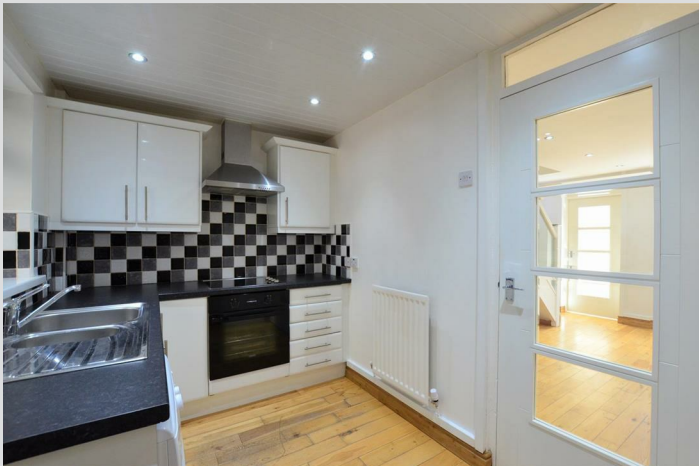
Fitted wall and floor units with integrated appliances